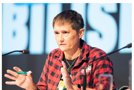
nurses union and an instructor for the Amerorganization Labor Notes.