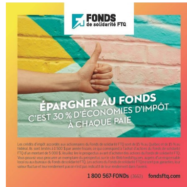
Newsletter sponsored by Le Fonds de solidarité