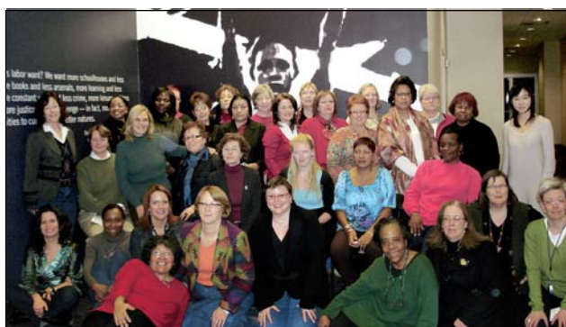
The union delegation, composed of Public Services International (PSI), Education International (EI) and the International Trade Union Confederation (ITUC) who attended the 53 rd session of the CSW at the UNO.

Since the opening of the 53 rd session of the Commission on the Status of Women (CSW) at the UNO, the member States and the non governmental organizations present at the meetings worked relentlessly to put forward amendments to the proposed conclusions, so that, in some cases, they better protect women’s rights to equality and, in other cases, to limit their obligations on this subject. After two weeks of debates and intensive lobbying, the agreed upon conclusions were passed by consensus on March 13th. Thanks, in large part, to societal pressures these conclusions offer the women’s movement and social organizations a tool to force governments to respect their obligations in respect to the sharing of responsibilities between men and women.