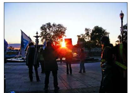
Day is breaking