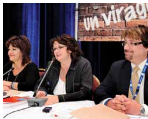
Coordination team for the negotiations

FÉDÉRATION INTERPROFESSIONNELLE DE LA SANTÉ DU QUÉBEC | www.fiqsante.qc.ca