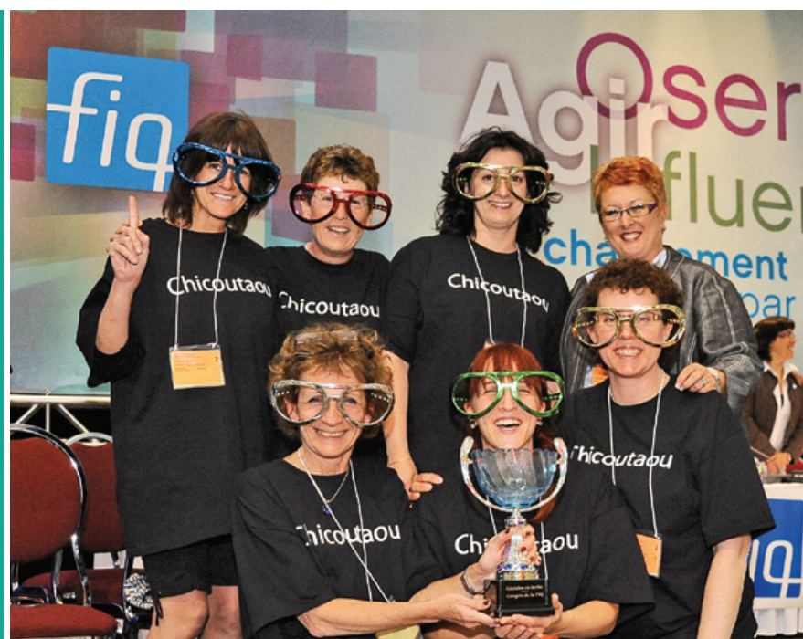
Congratulations to the winning team of the awareness-raising activity of "Géniales en herbe", Chicoutaou (Saguenay-Lac-St-Jean and Outaouais), who quickly answered the questions and showed their knowledge of the following themes: sociopolitics, women and equality, unionism, spelling, acronyms and the convention thematic.