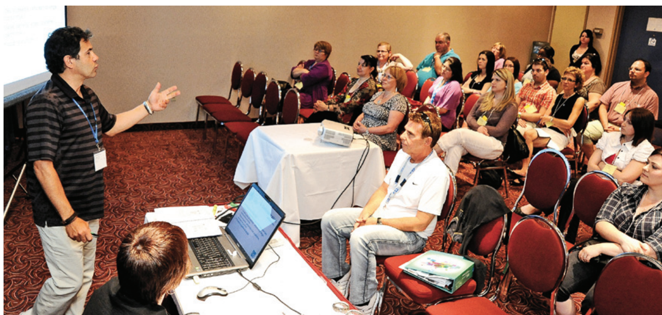
The delegates met in small groups for a workshop on "An organization adapted to the needs of the members" in order to discuss and reflect on the ways to bring the Federation even closer to its members.