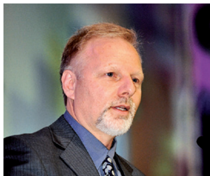
Jean-François Lisée, speaker. He was an advisor to Premiers Jacques Parizeau and Lucien Bouchard for five years.

Do things differently A public future in health, is it possible?