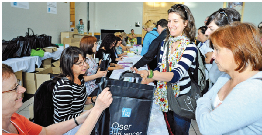
The first delegates arrived for registration as of 08:30.