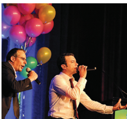
The political humour troupe, Les Zapartistes gave the delegation the opportunity to relax, and take a break for the evening.