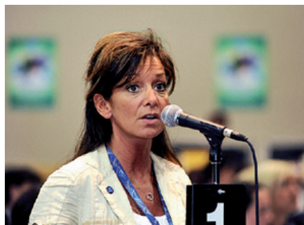
Discussions, shared reflections, interventions at the microphones, important votes and the election of the representatives at the federal level are part of the duties and responsibilities of the delegates attending the Convention.