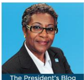
The President's Blog

Our seniors are not common mechanical parts!