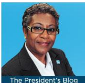
The President's Blog