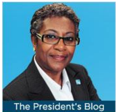
The President's Blog